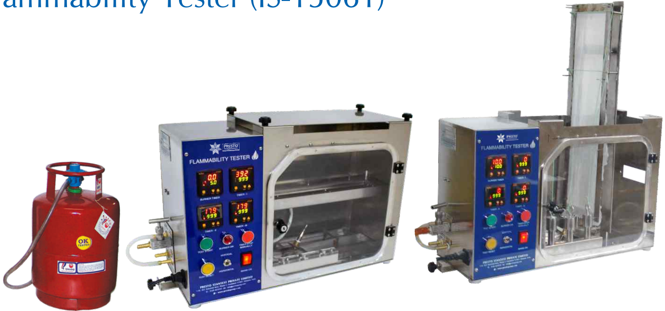
ANNEX A (Horizontal Test)